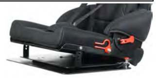
Seat tilt up to 10°