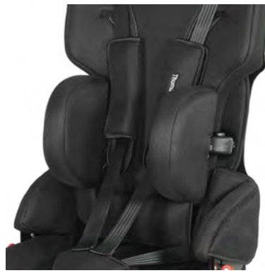
406 Upper body guides, swing-away