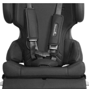
433 Front cover