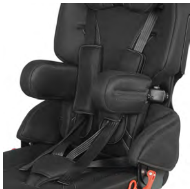
405 Lateral trunk supports, swing-away

*Upper body guides cannot be used together with lateral trunk supports