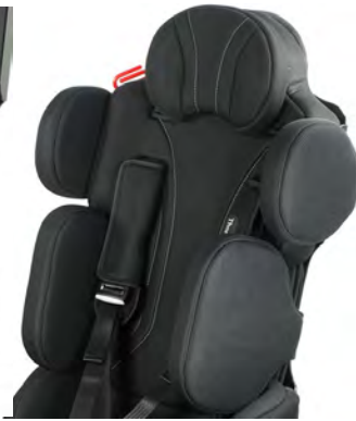
428 Upper body guides, rigid