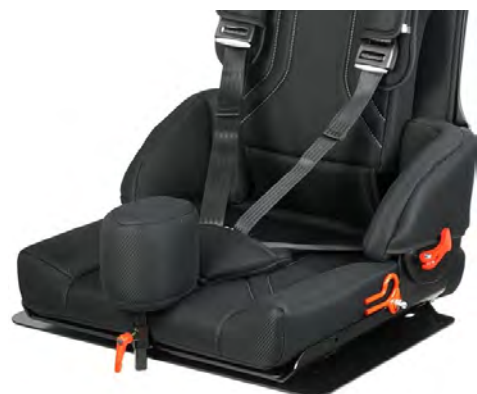
412 Abduction block