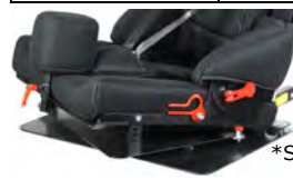
Swivel function* with lock out