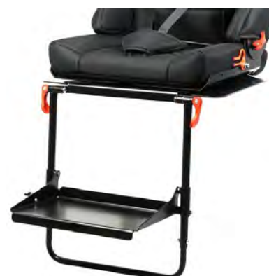
417 Footrest, foldable, angle adjustable