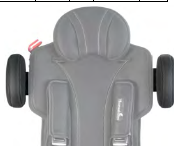
427 Shoulder guides