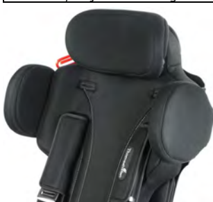
404 <YUXfYgřž \Y][ \hUX1 gtable