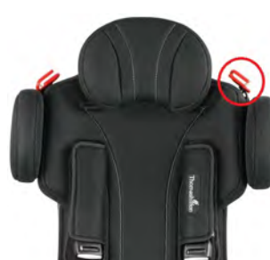
425 Add. upper belt guide*