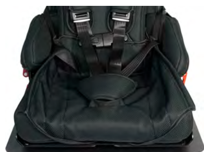
497 Incontinence seat pad