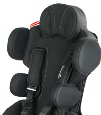
429 Lateral trunk supports, rigid