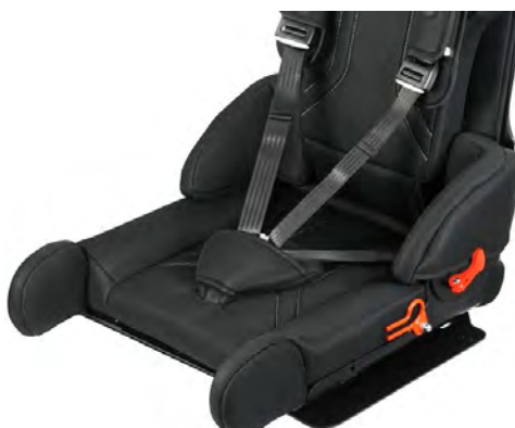
415 Leg guides, left + right, w. brackets